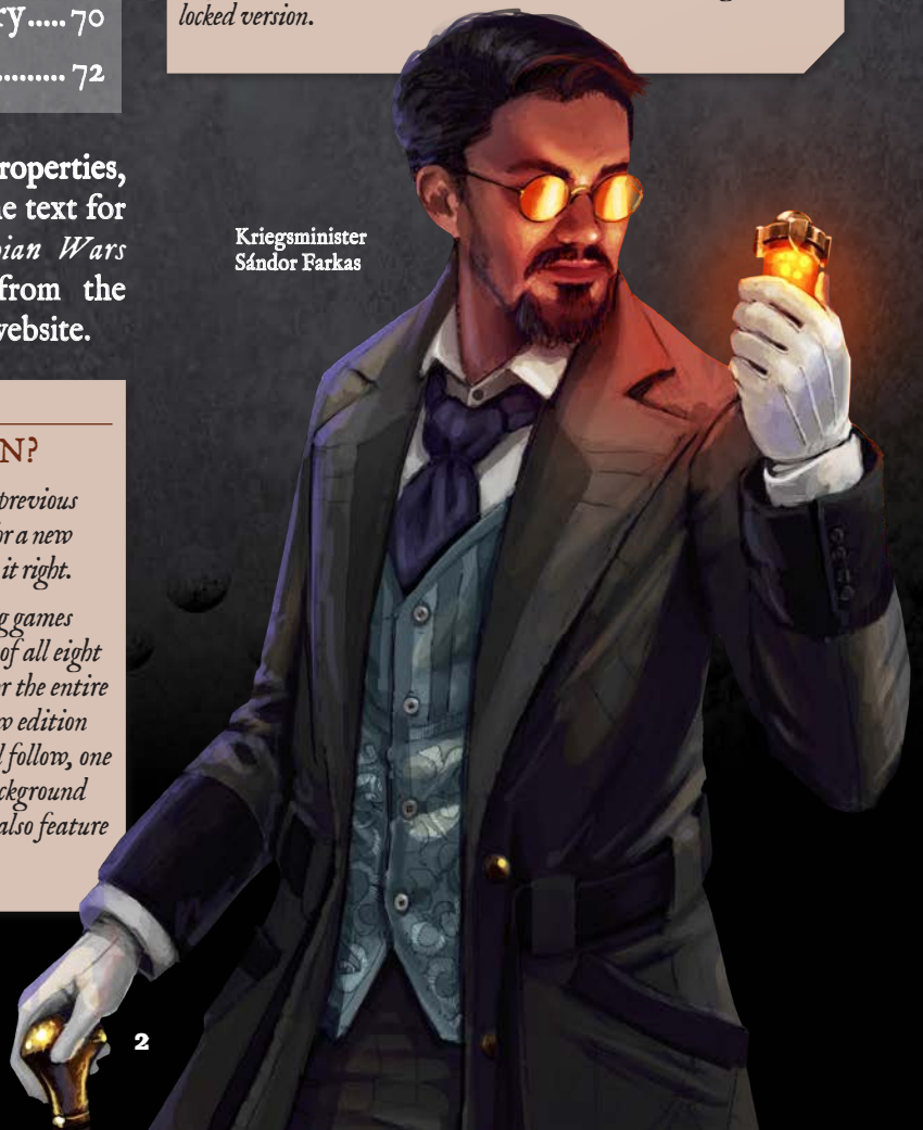
Kriegsminister Sándor Farkas

To ensure that every Admiral is able to continue playing games without interruption, we've released Launch Editions of all eight ORBATs. These are fully playable, and feature rules for the entire range of models available to their Faction. After the new edition has been released, the full versions of each ORBAT will follow, one at a time. These might contain additional rules and background information, an expanded set of Battlefleets, and may also feature balance tweaks or fixes.