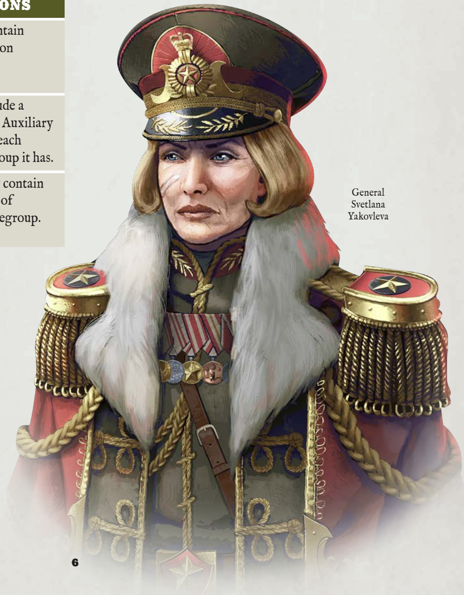
General Svetlana Yakovleva

If a Battlegroup's Commander unit is Annihilated , that Battlegroup immediately loses its Commander Bonus. In addition, a Special Command that is provided as a Commander Bonus cannot be issued if the Battlegroup's Commander Unit is not on the Battlefield (for example, if it is in Reserve ).