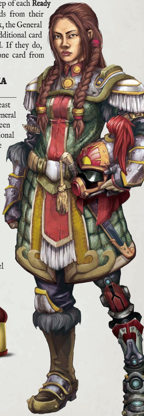
Khanum Bahadur Aiyurug Sarangerel

If this Force contains at least one Subterranean unit, its General may, after all units have been deployed, deploy an additional Subterranean Marker . Once all Subterranean units in the General's army have arrived from Reserve , the remaining Subterranean Marker is immediately removed from play.